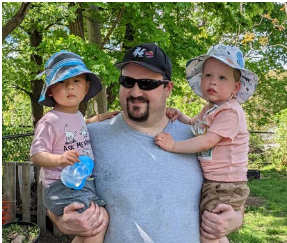
Taking a break from all that digging

A huge thank you to the families that donated a Saturday morning to help with these projects. We appreciate it so much!