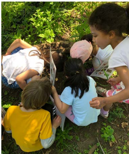
Working together to turn over a log

We found ants, slugs, snails, worms, centipedes, millipedes, roly-polys, and more! As we looked, we discussed the importance of these bugs in breaking down waste in the garden and aerating the soil as they crawl through it.