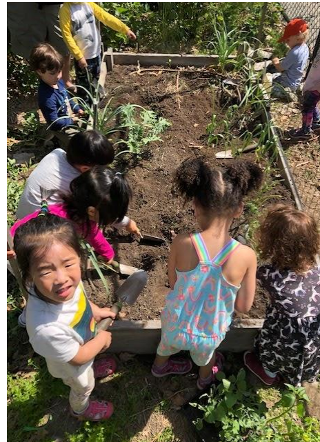
Filling our bed with tomato plants

The students did an excellent job planting tomatoes, tomatillos, peppers, and eggplant. Carefully wielding their trowels, they dug deep holes in the garden and tucked the plants into their holes.