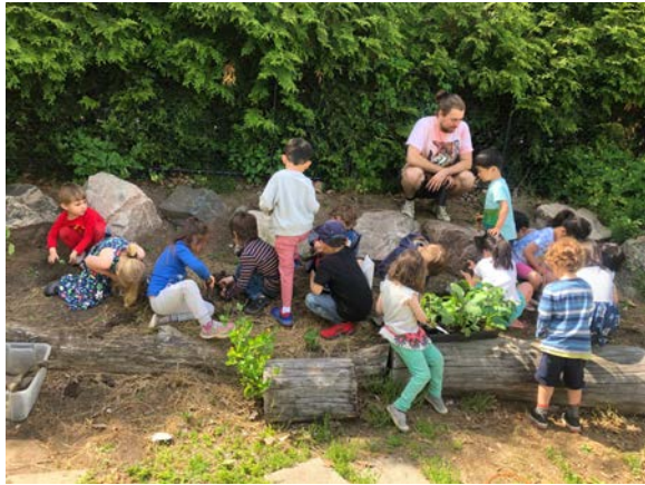
Working with Athos to plant peppers