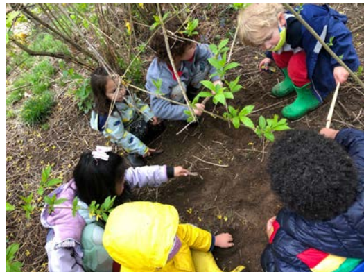
Studying fallen flower petals together

With so much to see out in the garden, we started out the month with a lesson to review what "counts" as a plant when we are out in nature. Are the rocks, the soil, or pieces of tree bark plants? Are the big trees in our garden plants, just as the tiny wildflowers are? Once a flower falls off a bush, is it still a plant?