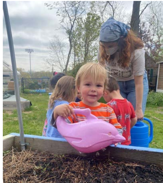
Showing off our watering cans!

Along with the Adventurers, the Explorers were also a huge help to us when it came to watering the garden. They helped carry the hose around the garden and filled up watering cans to keep everything moist as it grows.