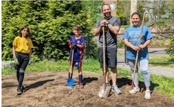
It was wonderful to have help from some Lemberg Alumni

A huge thank you to the families that donated a Saturday morning to help with these projects. We appreciate it so much!