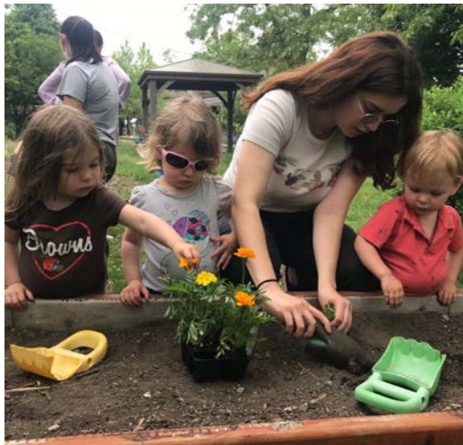
Planting Marigolds together

The Explorers helped us plant marigolds in one of our raised beds this month! The flowers are not only beautiful to look at, they can act as an all-natural insect repellent against pests, while also attracting the bugs that benefit our garden.